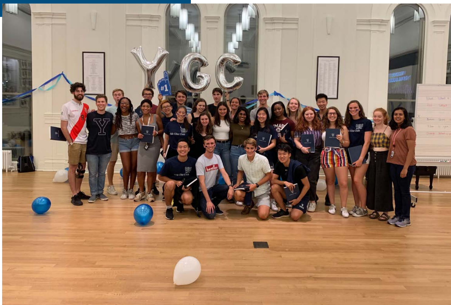
The new members of the 159th Glee Club at Tap Night this past September.